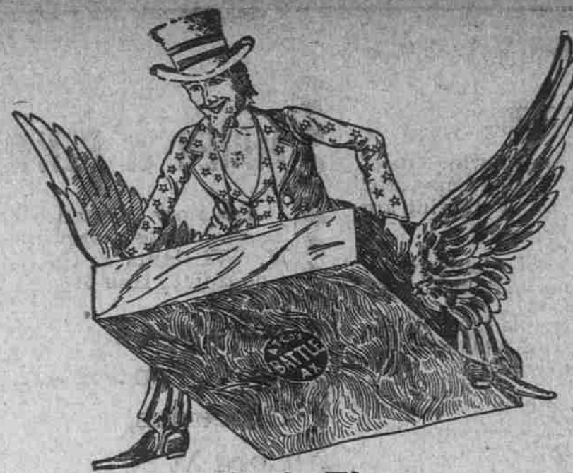
A High Flyer