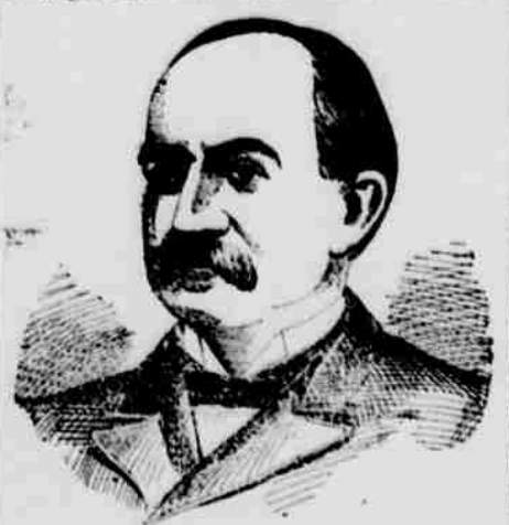
HON. JAMES B. MCCREARY, KENTUCKY.

Hon. James B. McCreary, the author of the bill extending the time before the Geary Chinese law is to go into effect, represents the Eighth district of Kentucky in the national house of representatives. He is a resident of the pretty town of Richmond, Ky., and immensely popular with the people of the Blue Grass state.