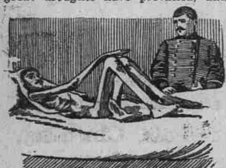
FAMINE VICTIM IN THE HOSPITAL AT MILIANAH.

Terrible State of Affairs Existing in the the African Province. Famine, starvation and despair have invaded Algeria, and the scenes of misery which are so familiar in harsher The Dalles, Or., climates and less fertile countries are here enacted in the midst of fair green fields and beneath a sky pitilessly blue, in mockery, it would seem, of the suf-fering beneath its dome. In years when rato is sufficient the harvests are sure and plentiful, but for several seasons great droughts have prevailed, and