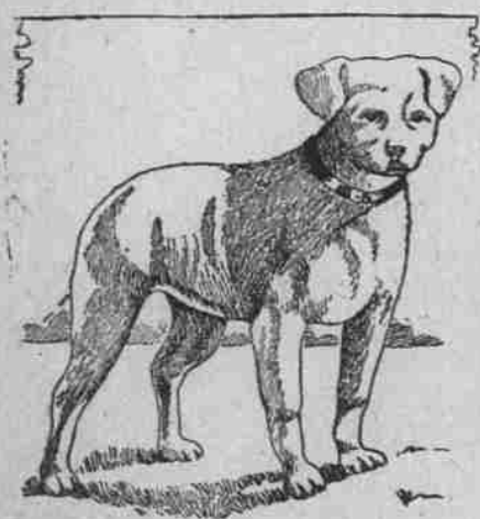
"STRIP, THE ELECTRICIAN."

Strip, when she feels her collar gone, turns round, retraces her steps, comes out again at the same end she went in at and lies down on the workmen's coats until she is wanted again. During the recent bitter cold weather Strip sometimes longed to shirk, and showed