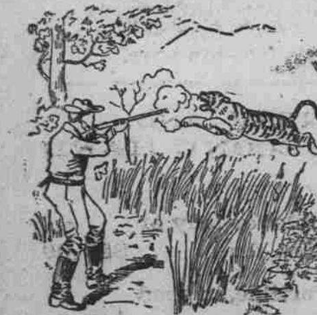
"AS HE WAS IN THE AIR I LET GO THE OTHER BARREL."

"One day two natives came to me at our place in Amoy, stating that a man had been carried off the night before from a neighboring village. This was just the opportunity I had been waiting for. Taking out a heavy express rifle which I had brought from London, I took the two natives to act as guides and started out. I had already learned something about the habits of the man eater and knew just how to go about it. From inquiry among the natives I ascertained the exact location of the lair of the tiger.