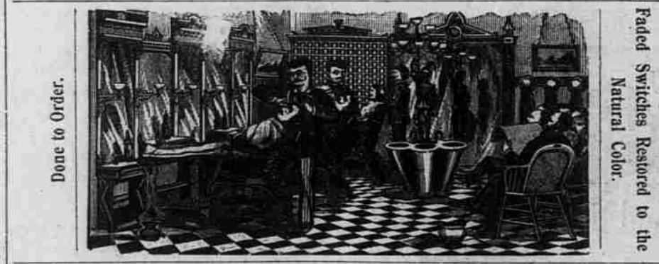
Done to Order. Faded Swatches Restored to the Natural Color.

At the old stand of R. Lusher, 110 Front St., The Dalles, Oregon.