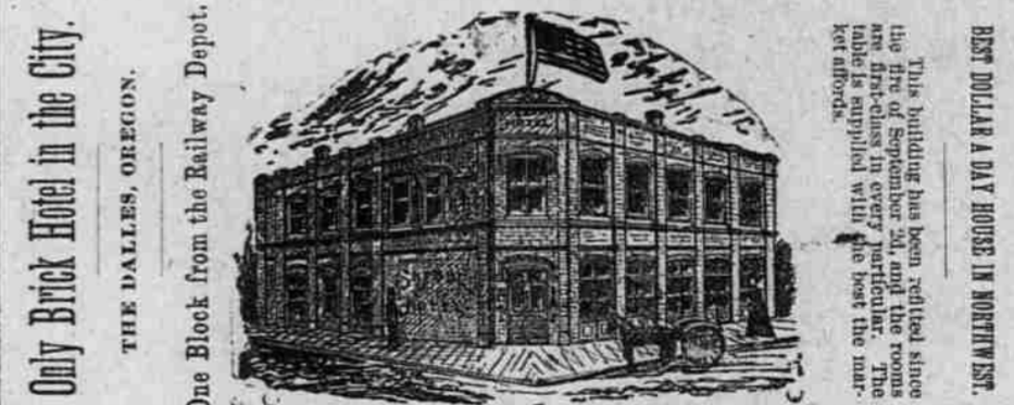
Only Brick Hotel in the City. THE DALLES, OREGON. One Block from the Railway Depot.