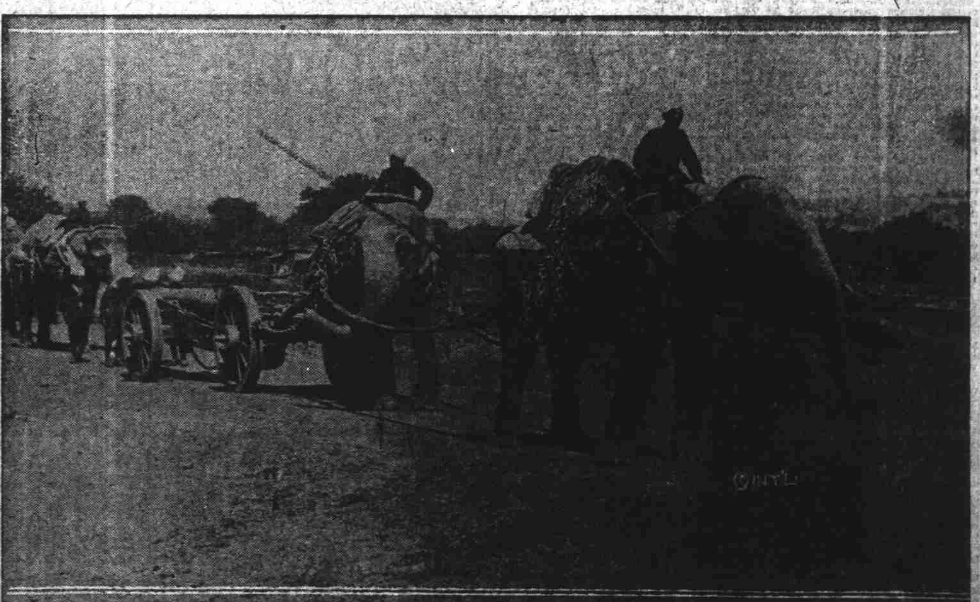
One branch of the military service of India is the Royal Elephant artillery. The huge beasts are trained to their duties, with the exactitude of disciplined soldiers, and haul their heavy guns over ground that horses or tanks could not traverse. The photograph shows a detachment of the elephant artillery out on a practice detail.