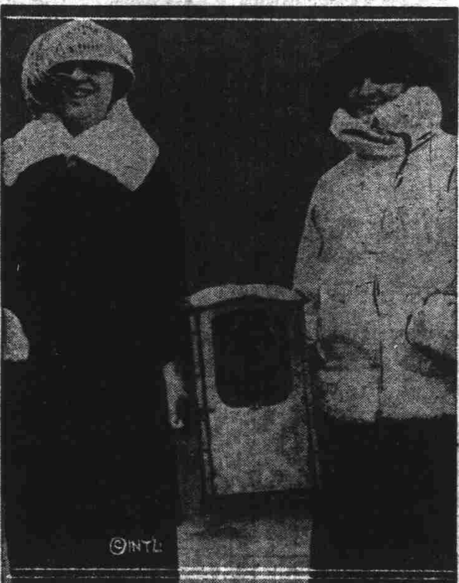
The sedanette for the poodle, first seen on the boardwalk at Atlantic City. The pet on a leash is something of an inconvenience in a crowd, but ensconced in this comfortable sedanette, the poodle or Pekinese may well enjoy the scenery.