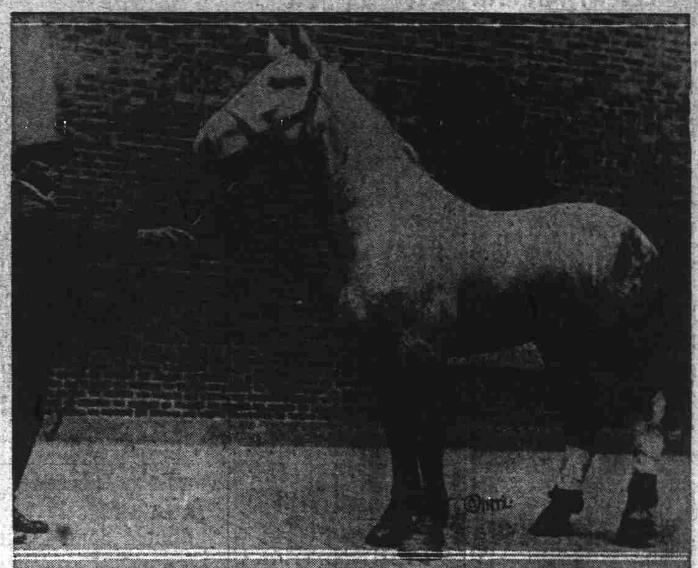
This stalwart grey bolted and ran wild across Boston until it came to the waterfront. The grey plunged in and was lost sight of for 40 hours, when members of the A. S. P. C. A. found it swimming in prison channel.