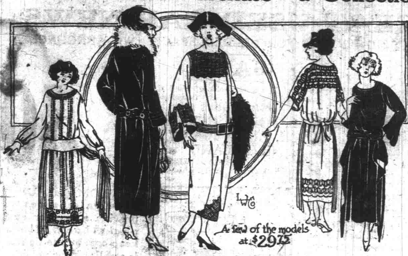
A few of the models at $29.75

The Sale on the Third Floor—Lipman, Wolfe & Co.