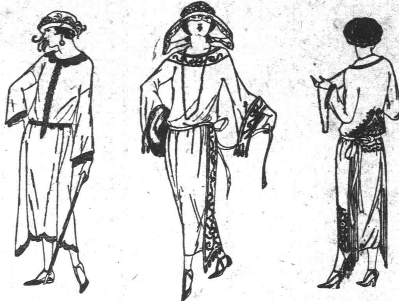
Opening Exhibit of the New

Place Your Orders Now for Engraved Holiday Greeting Cards—Stationery Dept. Main Floor