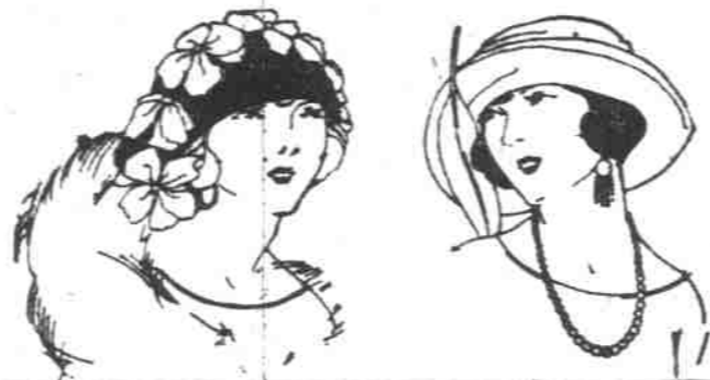
A New Millinery Sensation in Saturday's Birthday Celebration

Tomorrow (Saturday) These Birthday Bargains —and All the Others Earlier Advertised, if Quantities Permit. See the Windows, Too!