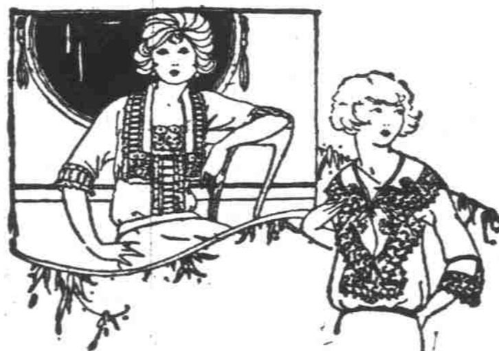
They're Bargains, Fine Bargains—You Can See That at a Glance—

—Every hat in the group hand made—a dazzling array of new colors and trimmings—just one hat of a kind. Millinery Section—On the Third Floor