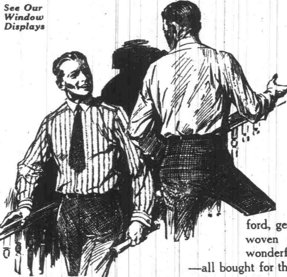
See Our Window Displays

—Selling such bloomers as these at a price as low as $1.39 is another of the surprising features of the Birthday Sale. They're of saten, lingette, aéro seço silk and fine jaquard—in single and double-garter styles. —Full cut bloomers with strong reinforcements. Choice of a good assortment of colors; also black and white. See them in our windows. On the Fourth Floor.