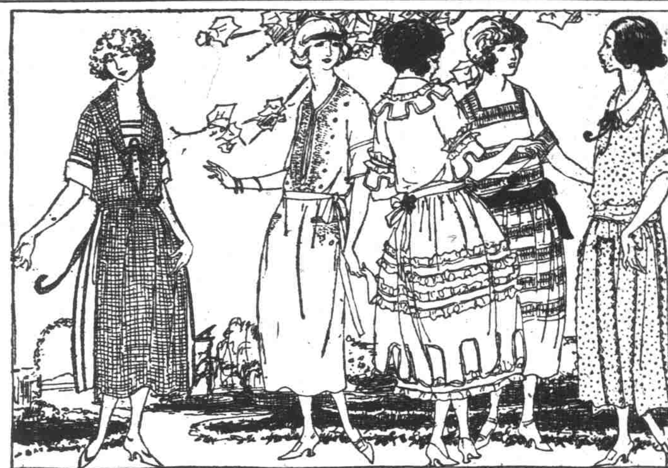
Tomorrow's Good News in the Fashion Salons