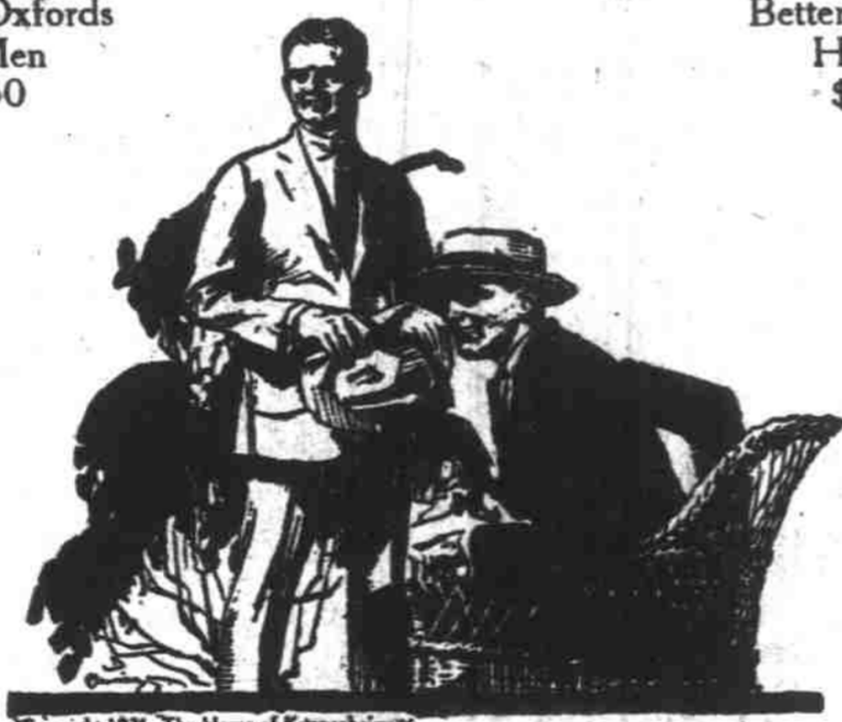
Copyright 1921, The House of Kuppenheimer