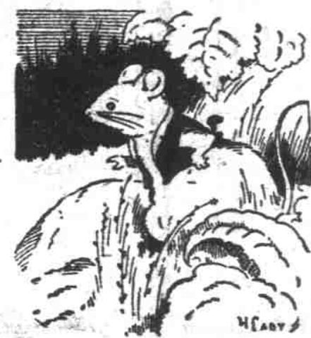
thing wrong," he would say over and over to himself

By now he was getting excited. He Mouse. Every time he heard that drumming funny little thrills ran all over him. He didn't know why. They just did, that was all. He simply must find that other Wood Mouse. He for-got everything else. He didn't even notice where he was going. He would drum, then wait for a reply. As soon as he heard it he would scamper in the direction of it, and then pause to drum again. Sometimes the reply would be very near, then again it would be so far away that a great fear would fill Whitefoot's heart that the stranger