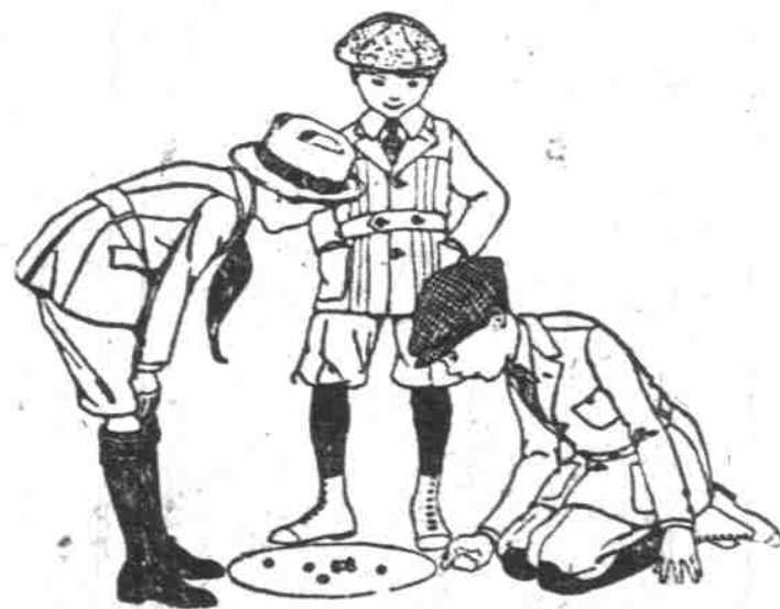
More Wear and Better Value—

Boys' "Sampeck" Suits and Leatherized Suits $12.45