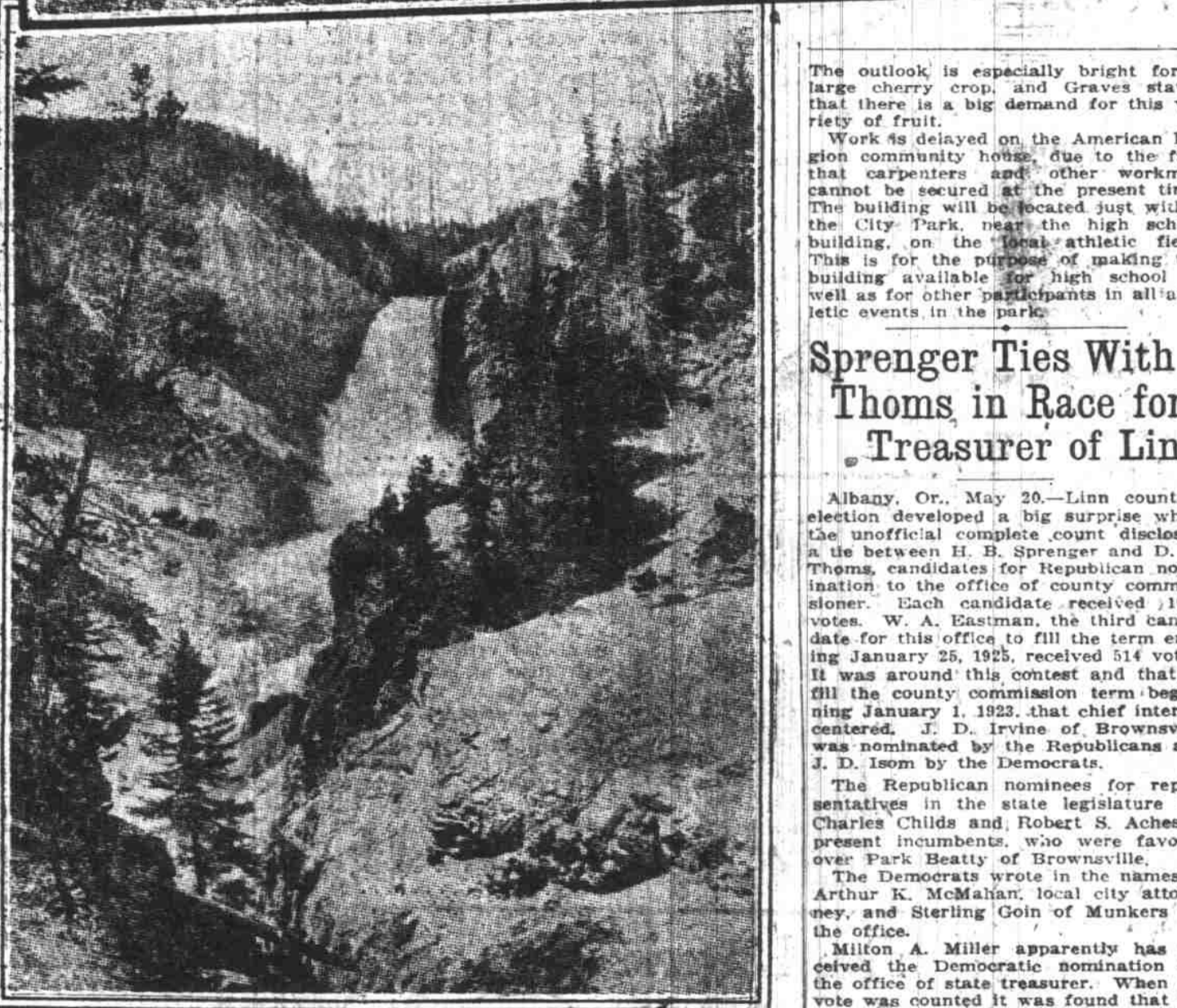
Some of the scenes which members of The Journal tours will see this summer include Mount Grinnell in Glacier National park (above), Paradise Inn at Rainier National park (middle) and the Great Falls of the Yellowstone in Yellowstone National park (below).

The outlook is especially bright for a large cherry crop, and Graves stated that there is a big demand for this variety of fruit.