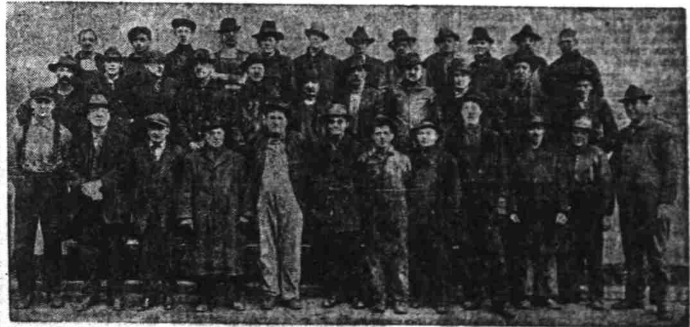
These are the men who MAKE Gasco Briquets