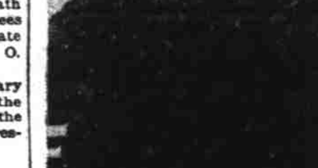
New York, Jan. 19.—Action to recover property being constructed at $10 an acre on land of that character, a man who knows farming should make a comfortable living from 40 acres, and in addition be able to lay aside from $500 to $1,000 each year.