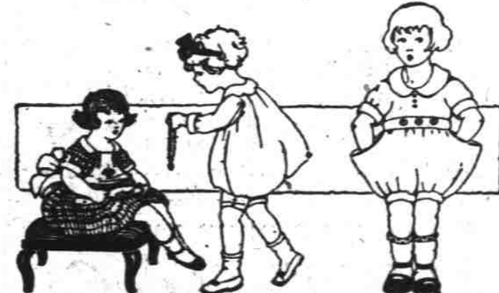
Infants' Section, Fourth Floor—Lipman, Wolfe & Co.

—Of crepe, drill and gingham in many colors and styles. See style pictured. Sizes 2 to 6 at $1.75. —Of crepe, gingham, drill, poplin and devonshire in rose, blue, maize. Sizes 2 to 6. Special at $2.79.