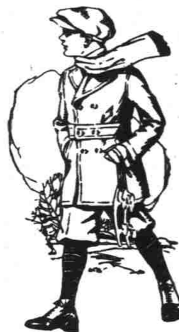
Fifth Floor—Lipman, Wolfe & Co.

"Sampeck" Overcoats —All at 25% off. The "Sampeck" overcoats for boys up to 17 years include raglan or plain, set-in sleeve and belted models.