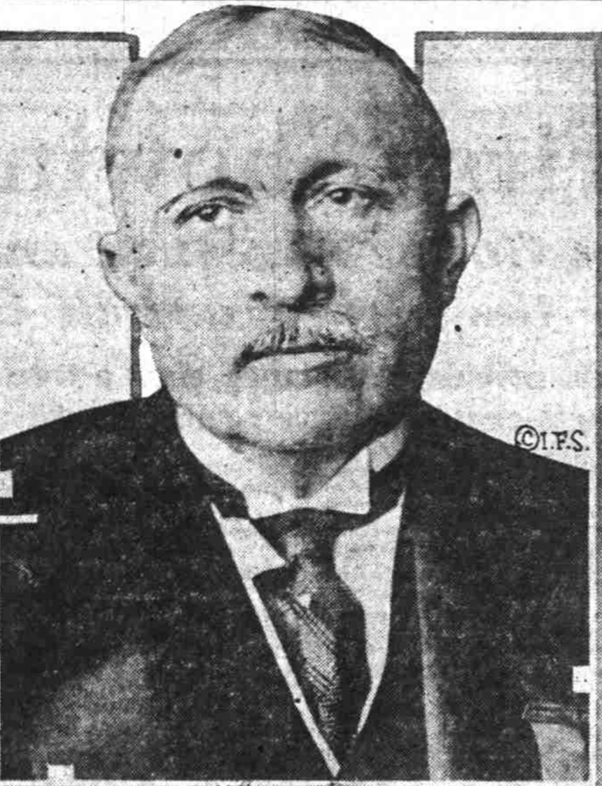
Rene Viviani, who left disarmament conference after signing four-power treaty today, bound for New York, whence he will return to Paris.

been almost completely cut off by an earthquake which rocked the city several days ago, according to advices to the Japanese embassy here today.