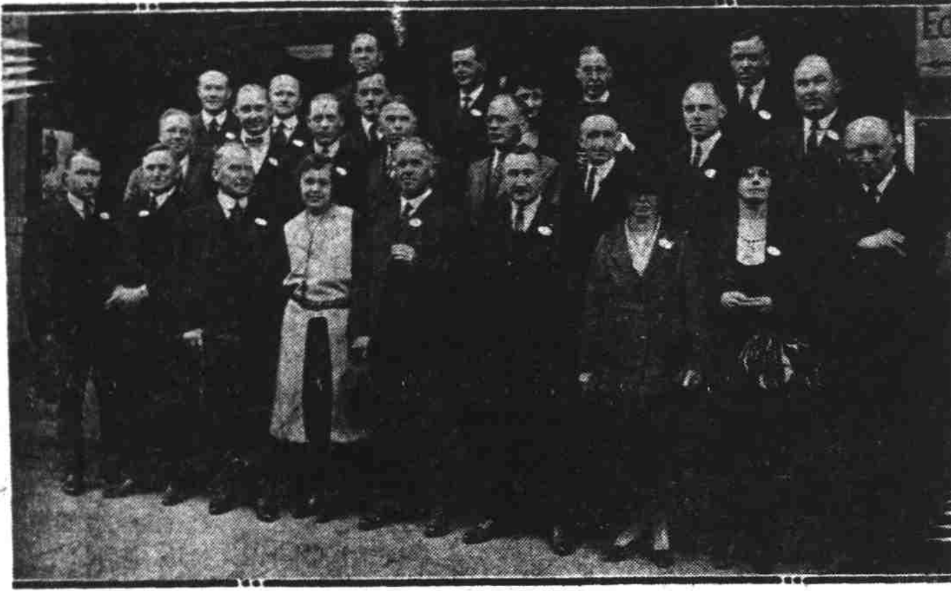
Semi-annual meeting of officials of local Chambers of Commerce and Commercial clubs held Monday at headquarters of State Chamber of Commerce for exchange of ideas and studies in cooperation. Annual meeting will be held at University of Oregon school of commerce at Eugene six months hence.