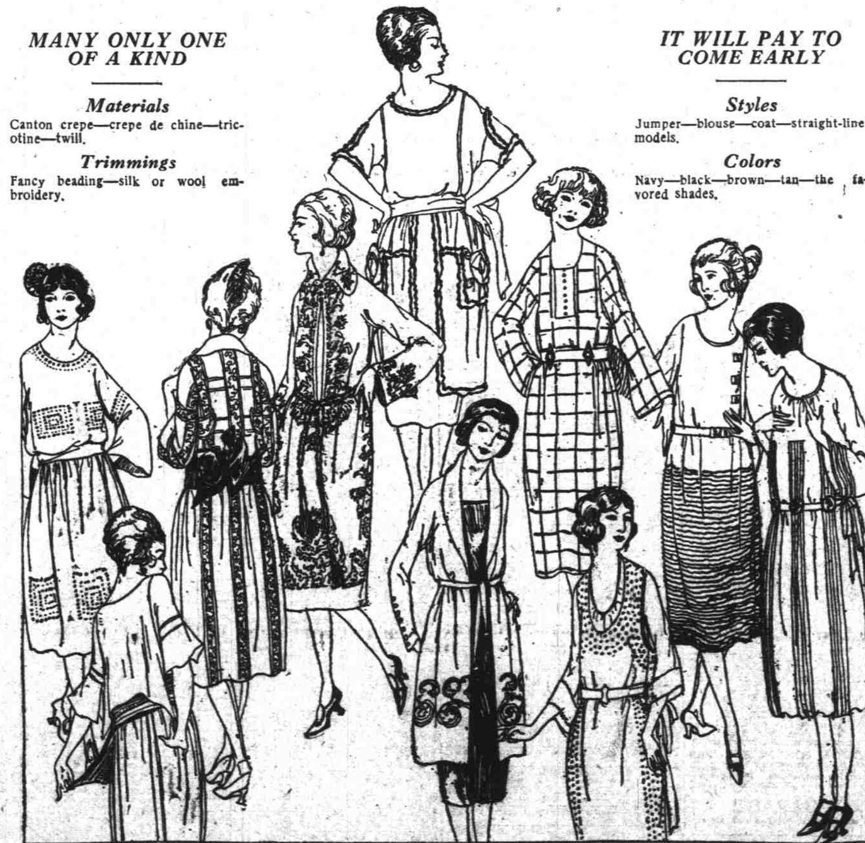
SOME OF THE STYLES SKETCHED

Navy—black—brown—tan—the favored shades.