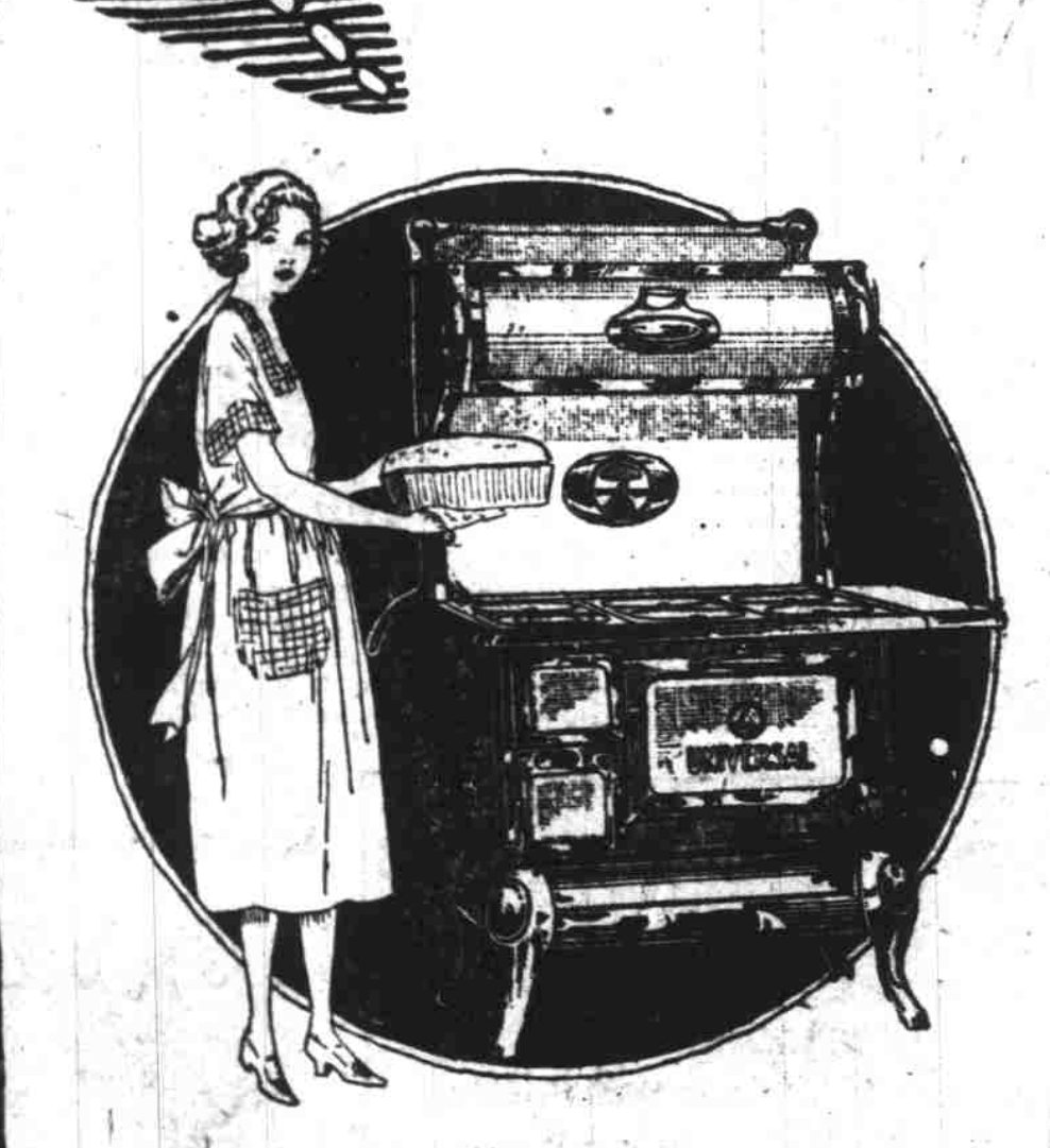
UNIVERSAL WOOD AND COAL RANGE

-Meier & Frank's: Bixth Floor. (Mail Orders Filled.)