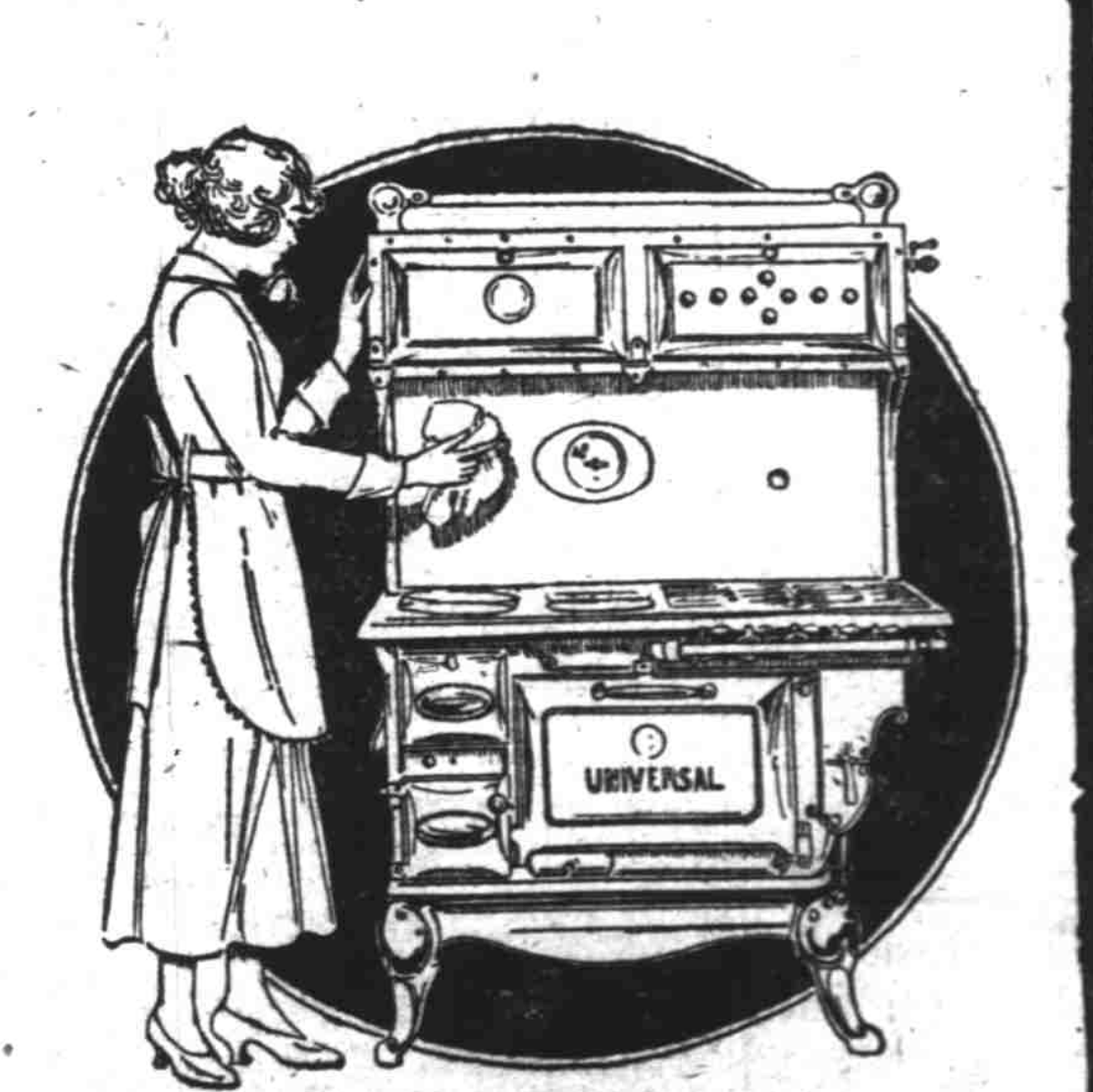
UNIVERSAL COMBINATION RANGE