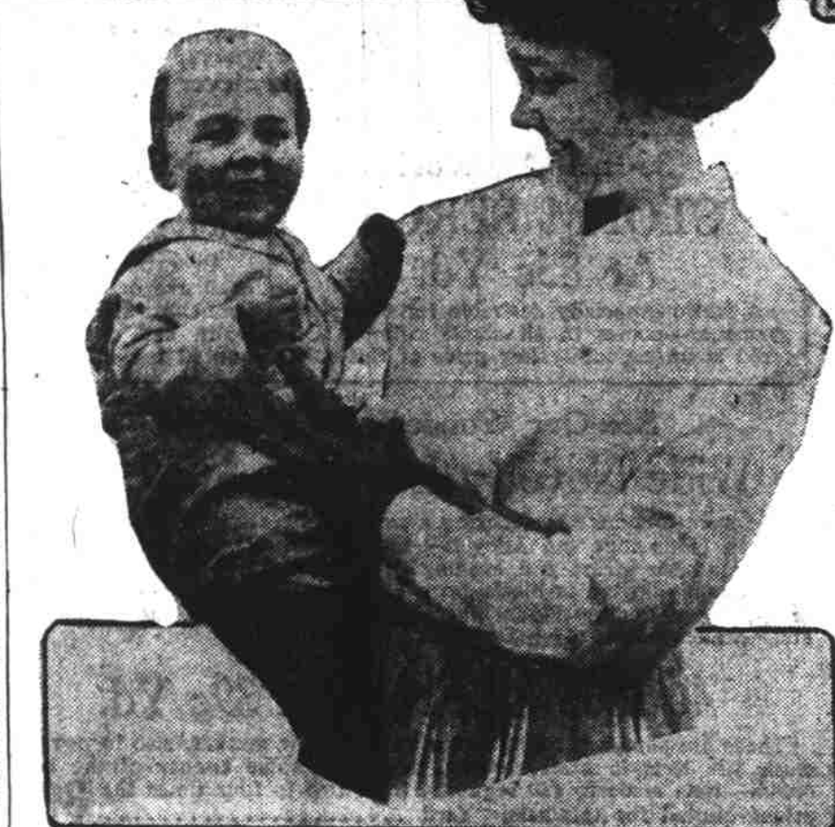
The 58 little guests of the Albertina Kerr Nursery Home at East Twenty-second and Sandy boulevards were given savings deposits in the Lumbermen Trust Company bank last week and are regular members of The Journal Thrift family. Above—Group of contented kiddies. Center—The Albertina Kerr home, opened in June. Below—One of the happiest members of the Thrift family.