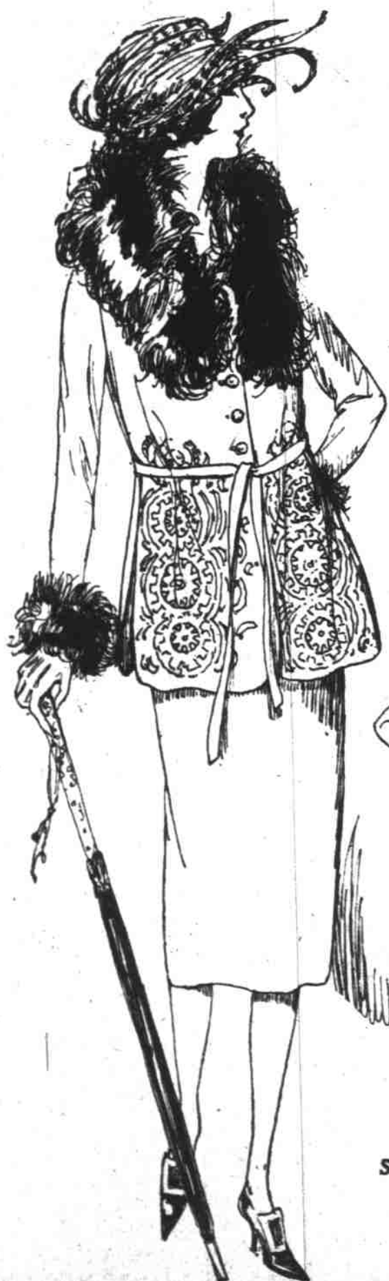
Suits sketched at $57.50