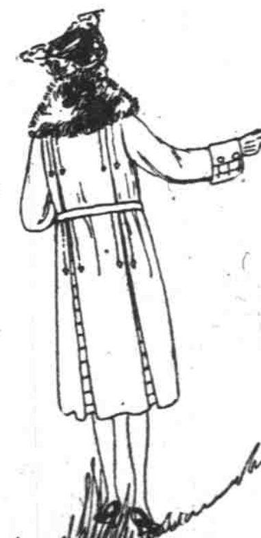
Coats sketched at $39.75