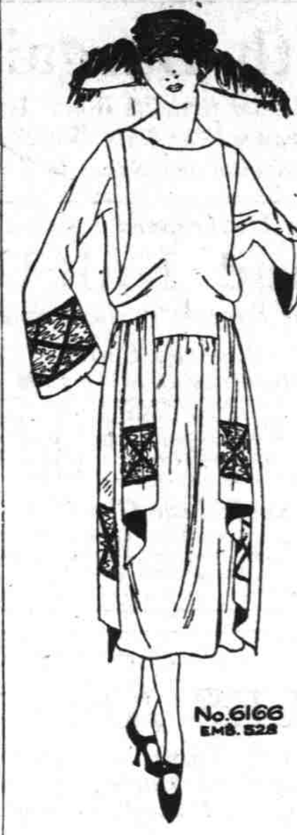
For Daytime Wear

While the slender, straight silhouette daytime wear, a slight leniency is permitted in the way of suggested buofsoftly draped blouse tops a slender skirt, Portland schools, has returned to Port- but added width is attained by hanging land following a visit of two months in three graduated, cascade panels over the East, during which she visited in each hip. They may be faced with a Chicago, New York and other cities of contrasting color and embroideredinterest. She is making her home at touches which add to their decorativeness without taking in the slightest from their usefulness. The oval neckline and Mr. and Mrs. Robert H. Morrison, who bell sleeves, cut kimono fashion, are in have beeen occupying the home of Dr. keeping with the newest feeling of the mode,