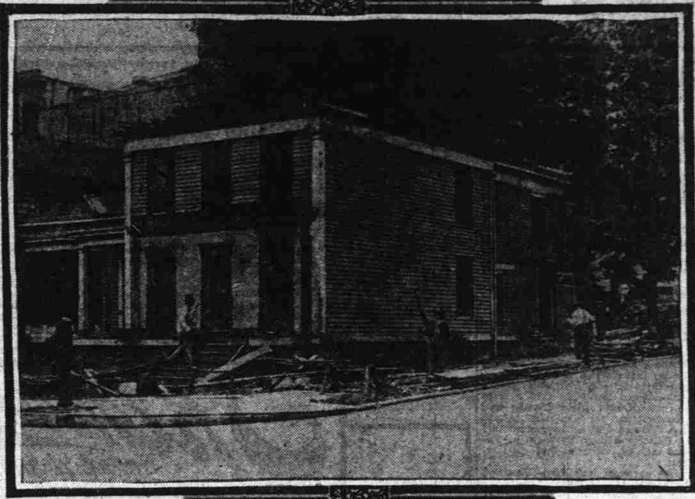
House at the southeast corner of Park and Yamhill which will make way for new auto stage station. The property belongs to the Corbett estate and the house was built in 1854 on the present site of the City Hall.

Wreckers were busy last week removing two old residences at the southeast corner of Park and Yamhill streets, preparatory to the erection of a station for automobile buses on the quarter block at that location. The house on the corner is one of the oldest residence structures in Portland. It was built in 1854 and originally stood on the site of the present city hall. A few years later the house was purchased by Henry J. Corbett and moved to the corner of Park and Yamhill.