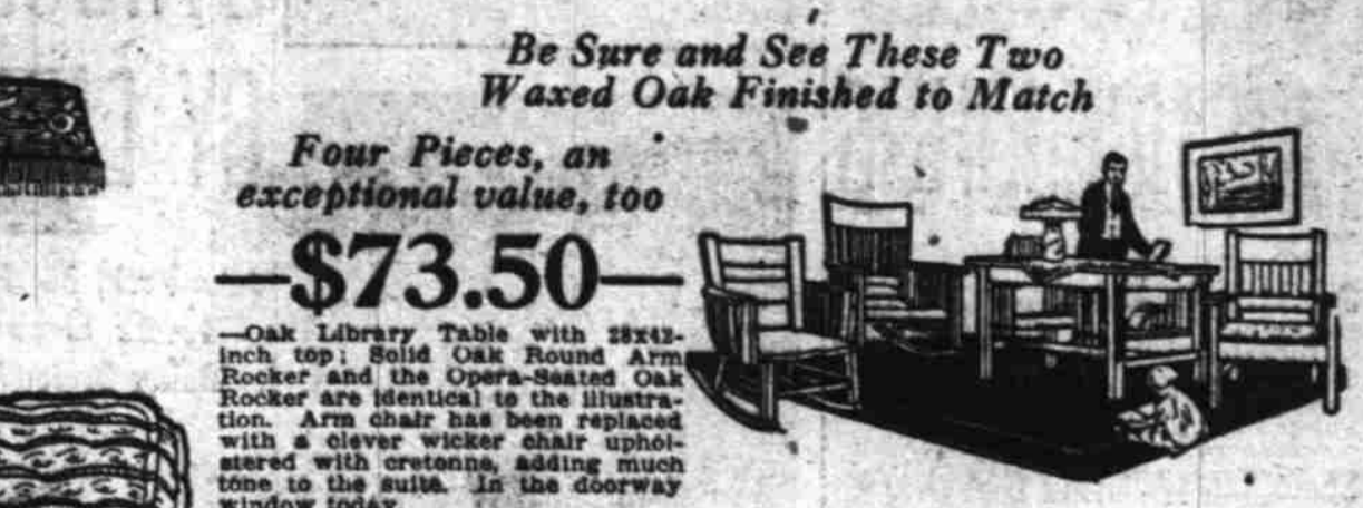
Four Pieces, an exceptional value, too —$73.50—

—Oak Library Table with 28x42-inch top; Solid Oak Round Arm Rocker and the Opera-Seated Oak Rocker are identical to the illustration. Arm chair has been replaced with a clever wicker chair upholstered with crotona, adding much time to the suite. In the doorway window today.