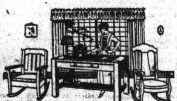
Here's a Wonderful-Value Three Massive Pieces —$94.50—

—Detailed explanation of each is unnecessary. You have read and heard much about Simmon's Beds and Springs that are "Built for Sleep" lately; but Edwards would like to have you note that it's a FORTY-FIVE POUND Felted Cotton Mattress that's with this Simmon's "Built for Sleep" Bed and Springs.