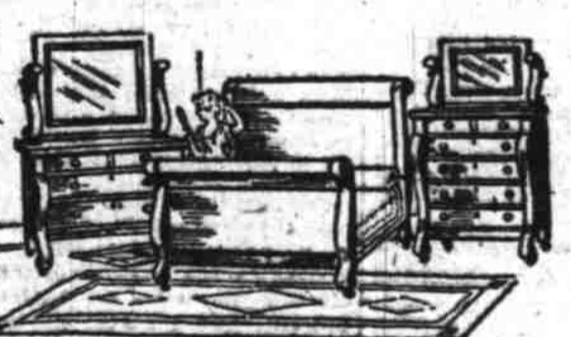
Colonial Suite in Walnut or Mahogany —$148—

—Massive Mission-Post Library Table, with very pretty grain quartered oak top and legs; rockers are of solid oak and the auto-cushion seats are covered with heavy wool stock genuine leather. Not identical, though very similar to illustration.