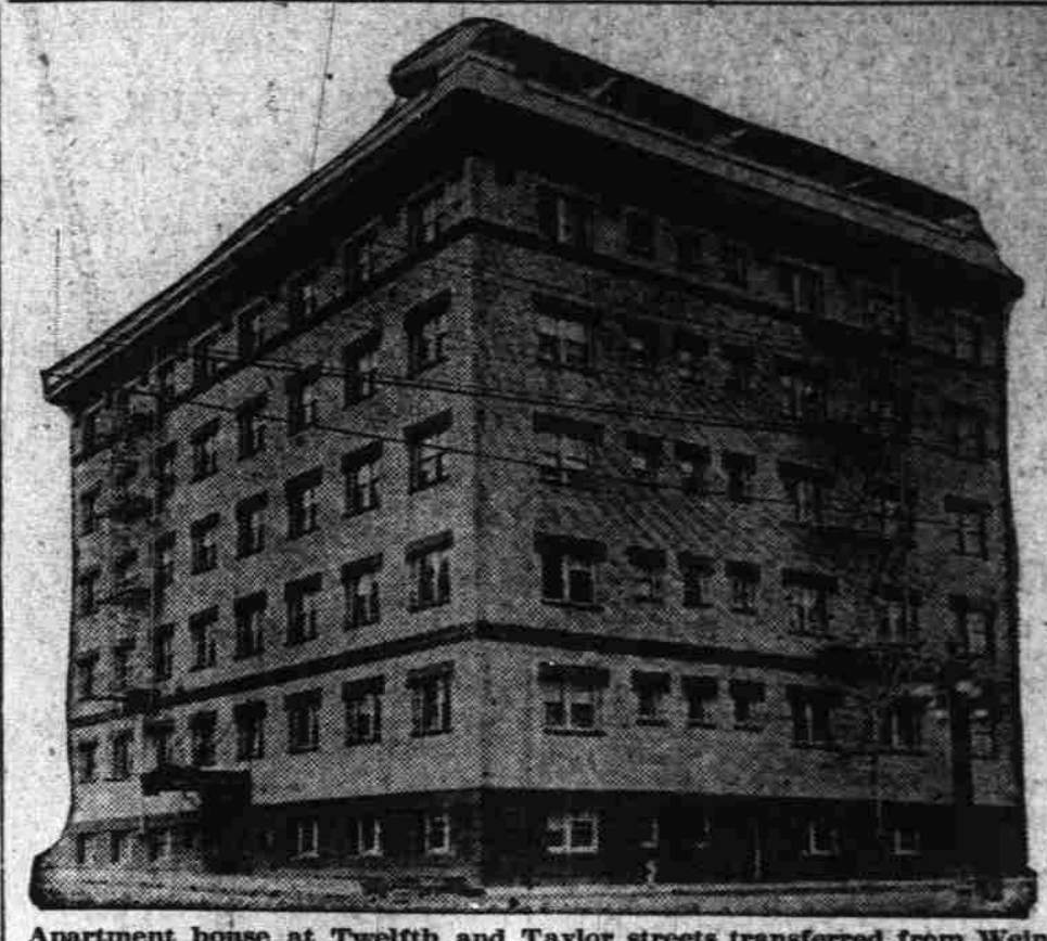
Apartment house at Twelfth and Taylor streets transferred from Wein-