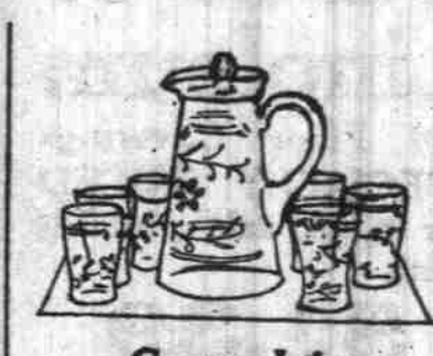
Grape Juice Sets $3.29 Regularly $4.50. Light cut glass grape juice sets—1 covered jug and 6 glasses.