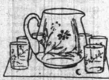
Cut Glass Water

Aluminum Dish Pans $4.39 Regularly $5.50. Oval aluminum dish pans that measure 13x18x4 1/2 inches.