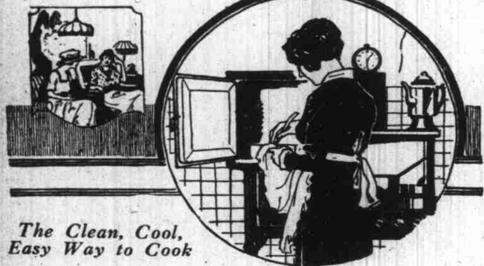
The Clean, Cool, Easy Way to Cook