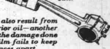
Scored pistons also result from the use of inferior oil—another illustration of the damage done when the oil film fails to keep the metal surfaces apart.