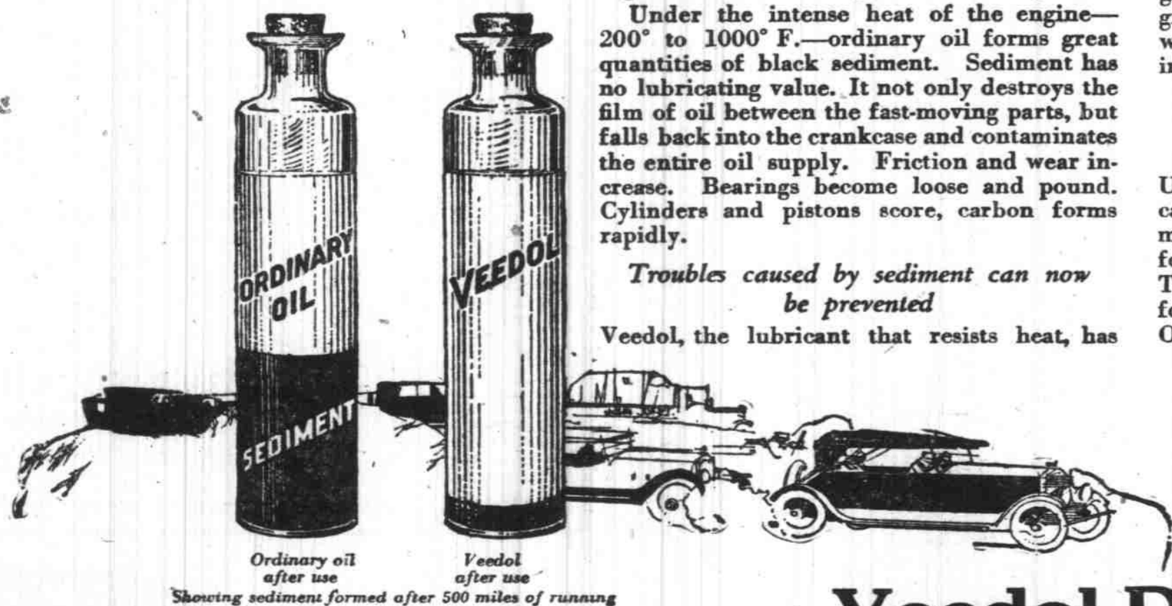
Ordinary oil after use showing sediment formed after 500 miles of running. Veedol after use.

Pacific Division Office, 1110 Claus Spreckels Bldg. San Francisco, Cal. Warehouse—8 Front Street, Portland, Ore.