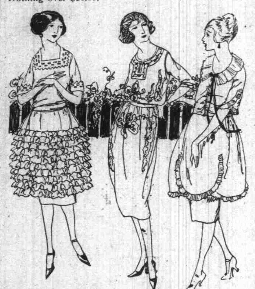
Featuring Tomorrow a Most Remarkable

The Lower Price Downstairs Store millinery section is ready for last day Easter buyers. Hundreds of new hats in wanted shapes and colors at the lowest prices. Nothing over $10.00.