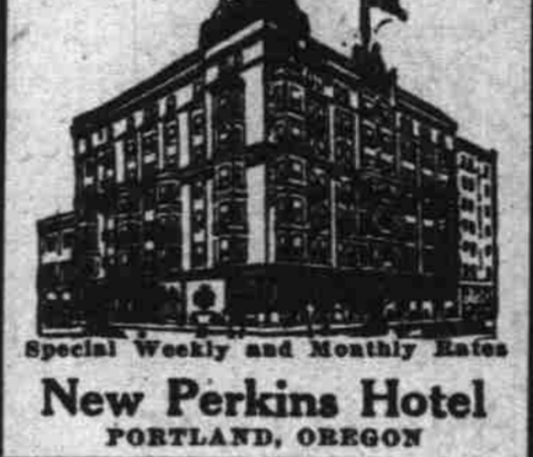
New Perkins Hotel PORTLAND, OREGON