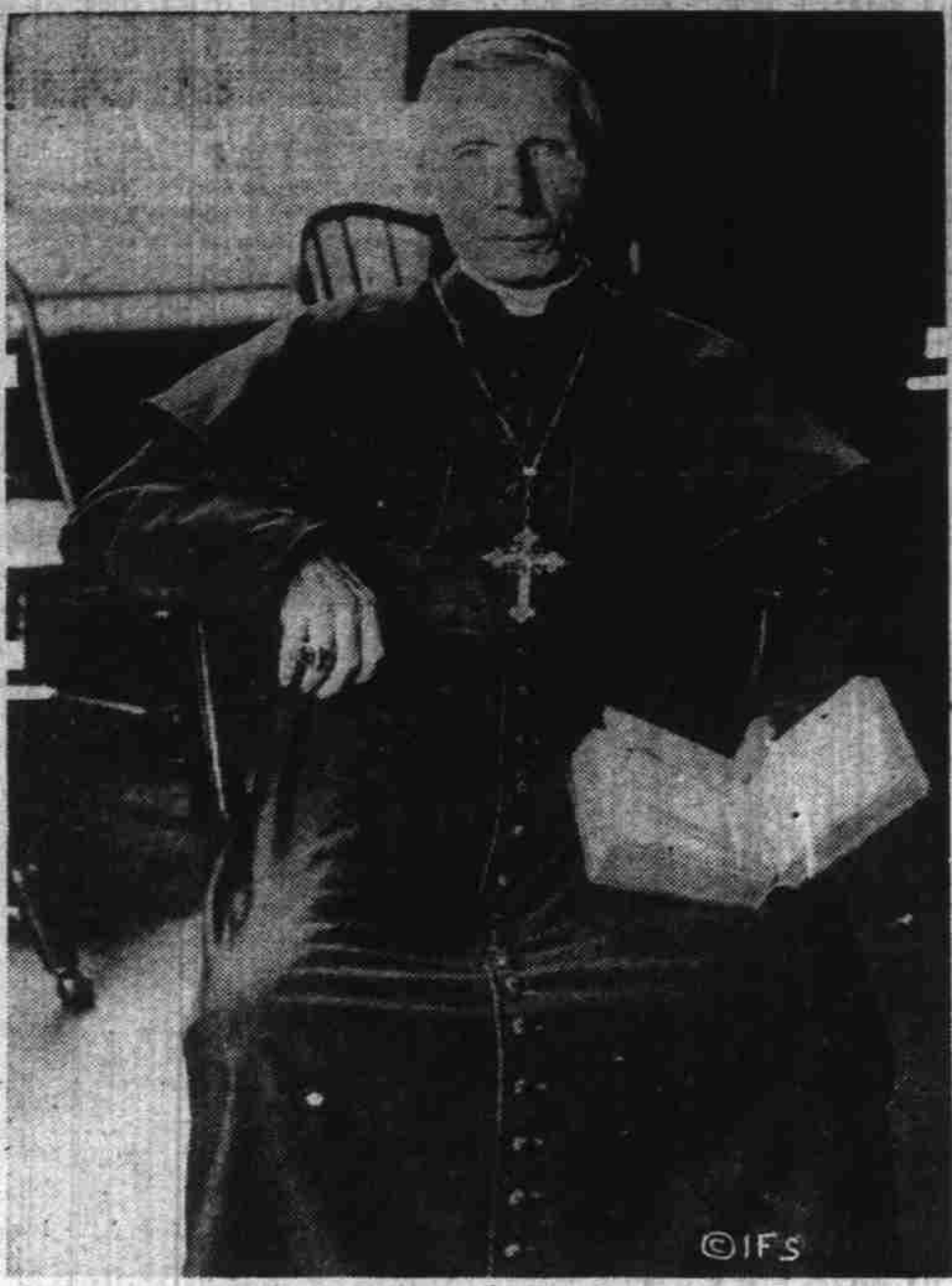
Recent photograph of the head of the Catholic church in the United States who died in Baltimore today. Cardinal Gibbons had been the most influential prelate in America for the past half century and had been the friend and counselor of many men high in public life.