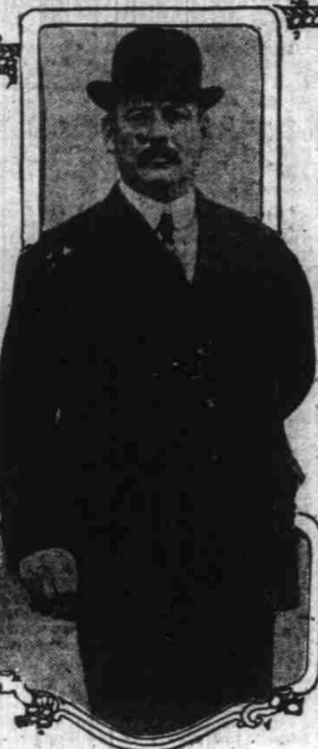
Weiser, from which place they will make the journey together.

FORMER U. S. Senator John W. Weeks of Massachusetts will be the new secretary of war, President-elect Harding told newspaper men with whom he was in conference Monday afternoon on his way north after his vacation in Florida. Weeks graduated from the naval academy and served as a midshipman from 1881 to 1883.