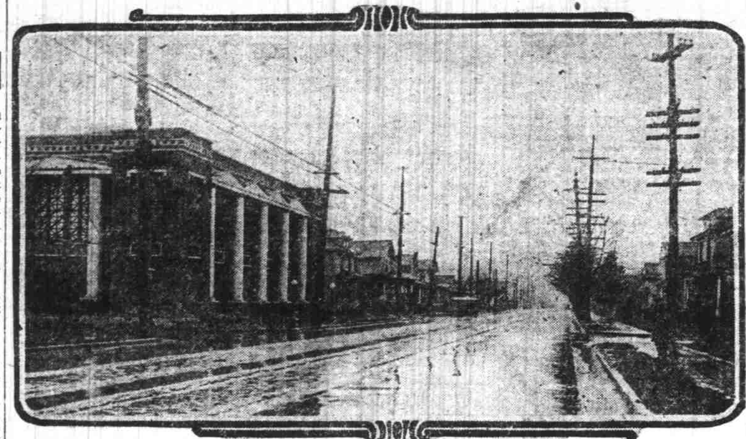
East Thirty-ninth and Hawthorne with new Masonic Temple, one of desirable residence regions of east side