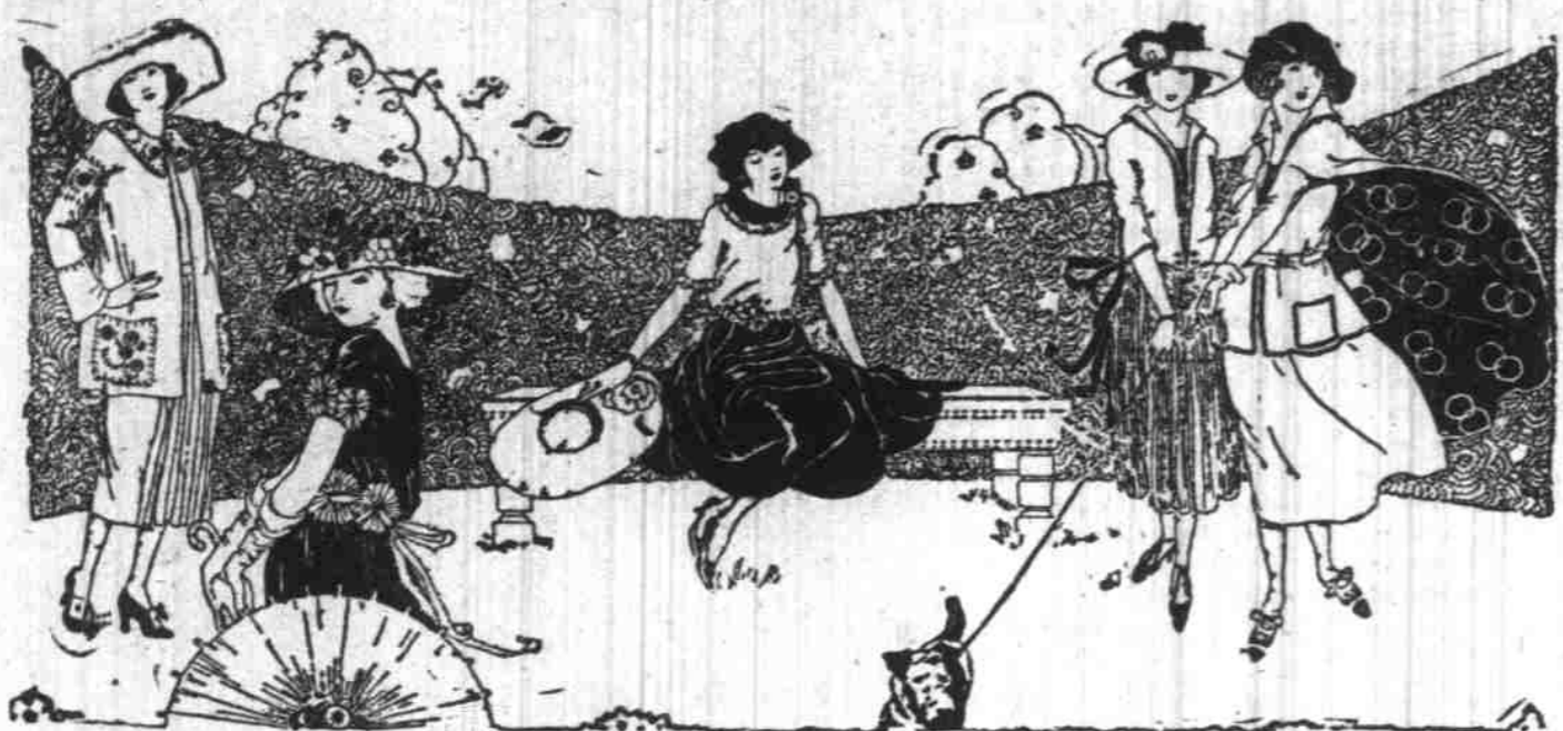
Exhibit of New Fashions

—Revealing the Spring Season's Smartest Modes in Women's Suits, Coats, Dresses, Waists