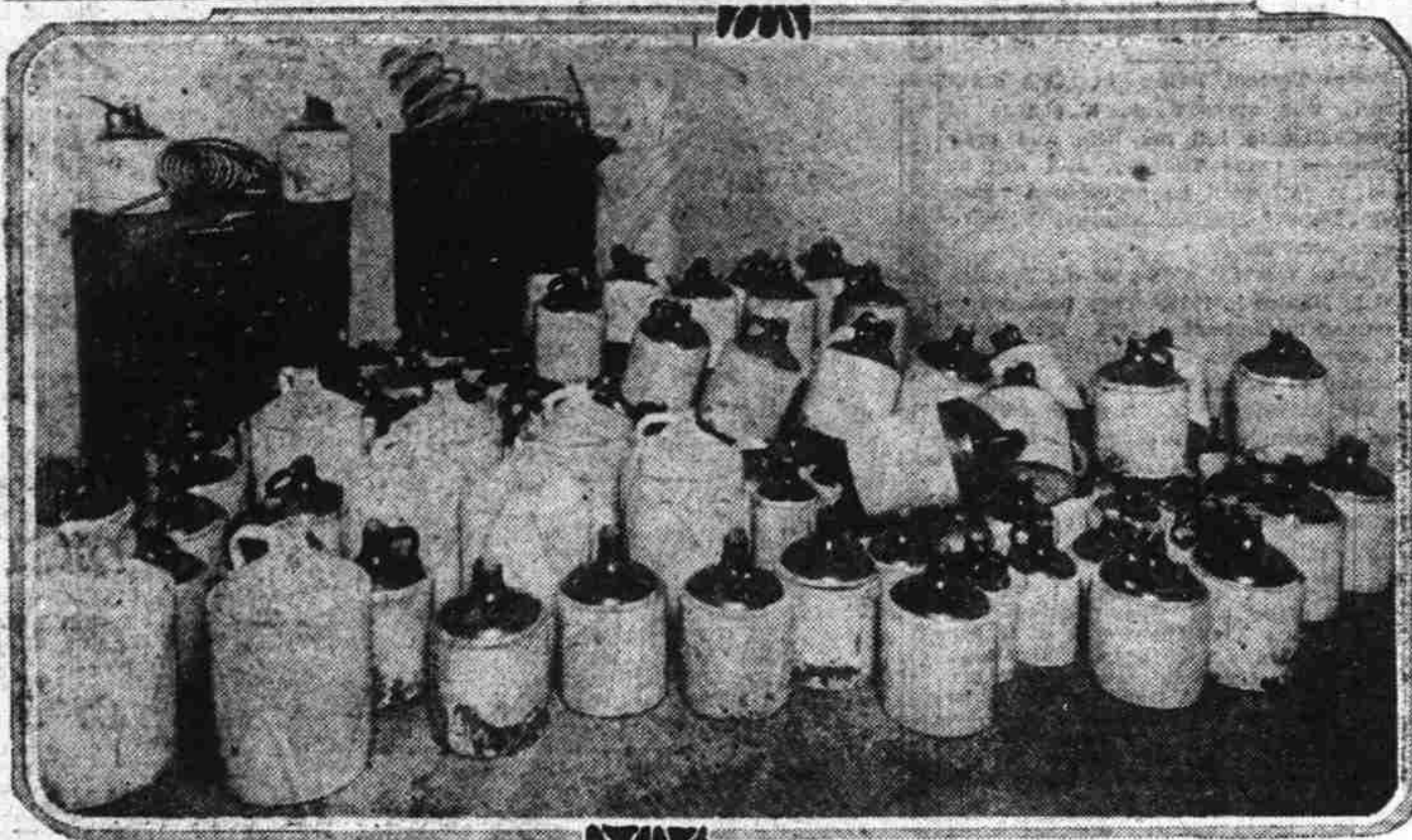
Loot of deputy sheriffs in Tuesday's raid on farm. Jugs and stills found buried