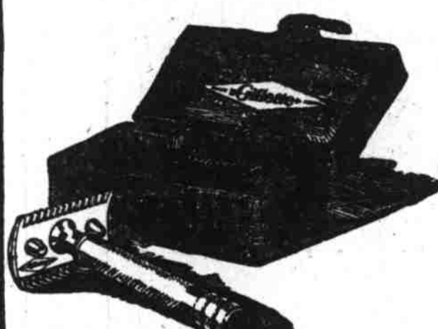
THE STANDARD SET. The original Gillette set, Model No. 460, as pictured, with Triple Silver Plated Razor. 24 Shaving Razors (12 double-edged Blades). Genuine Leather Case. $5.00. Gold plated, $6.00.