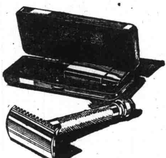
SET No. 501 is flat and compact, with its silver plated metal case embossed with Basket pattern in high relief. Razor and 24 Shaving Razors (12 double-edged Blades). As illustrated, $5.00. A favorite set with men who travel. Gold plated, $6.00.