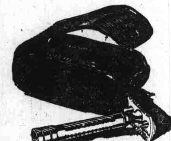
THE "BULL DOG" is a bit stockier in the handle; sturdy and businesslike. Triple silver plated. 24 Shaving Razors (12 double-edged Blades). Genuine Leather Case. $5.00. Gold plated, $6.00.

Coastal Factory: 72 St. Alexander St. Montreal, Quebec. New York: 120 Broadway. London: 100 Strand. Madrid: 100 Calle de San Francisco. Paris: 100 Rue de la Paix. Amsterdam: 100 Nieuwmarkt. Geneva: 100 Rue de la Paix. Canton: 100 N. Canal. Sourabaya: 100 J. P. Raffles. Cebu: 100 J. P. Raffles. Manila: 100 J. P. Raffles. Singapore: 100 Raffles Place. Batavia: 100 J. P. Raffles. Sourabaya: 100 J. P. Raffles.