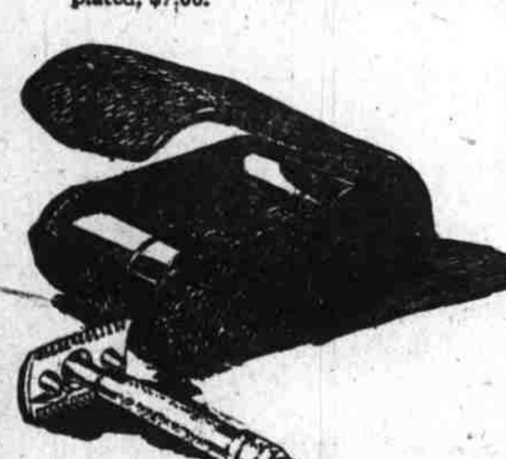
THE COMBINATION SET, known as No. 00, is—Gillette Razor, Shaving Brush, Shaving Soap and 24 Shaving Blades. All compactly contained in a handsome Genuine Leather Case. Razor triple silver plated. $7.50.