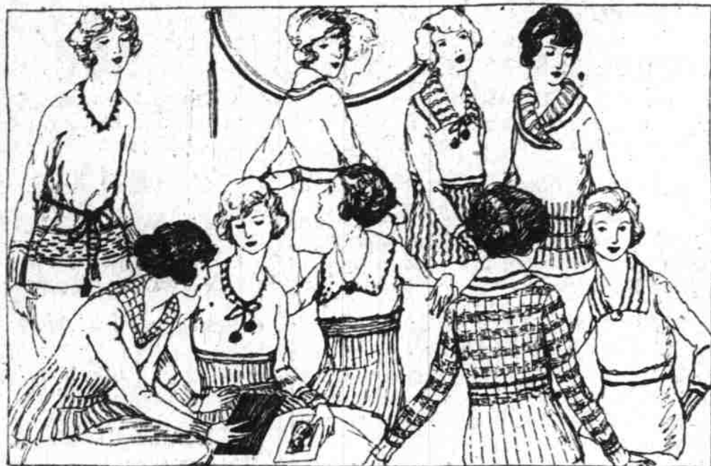
Center Aisle Main Floor Sale of