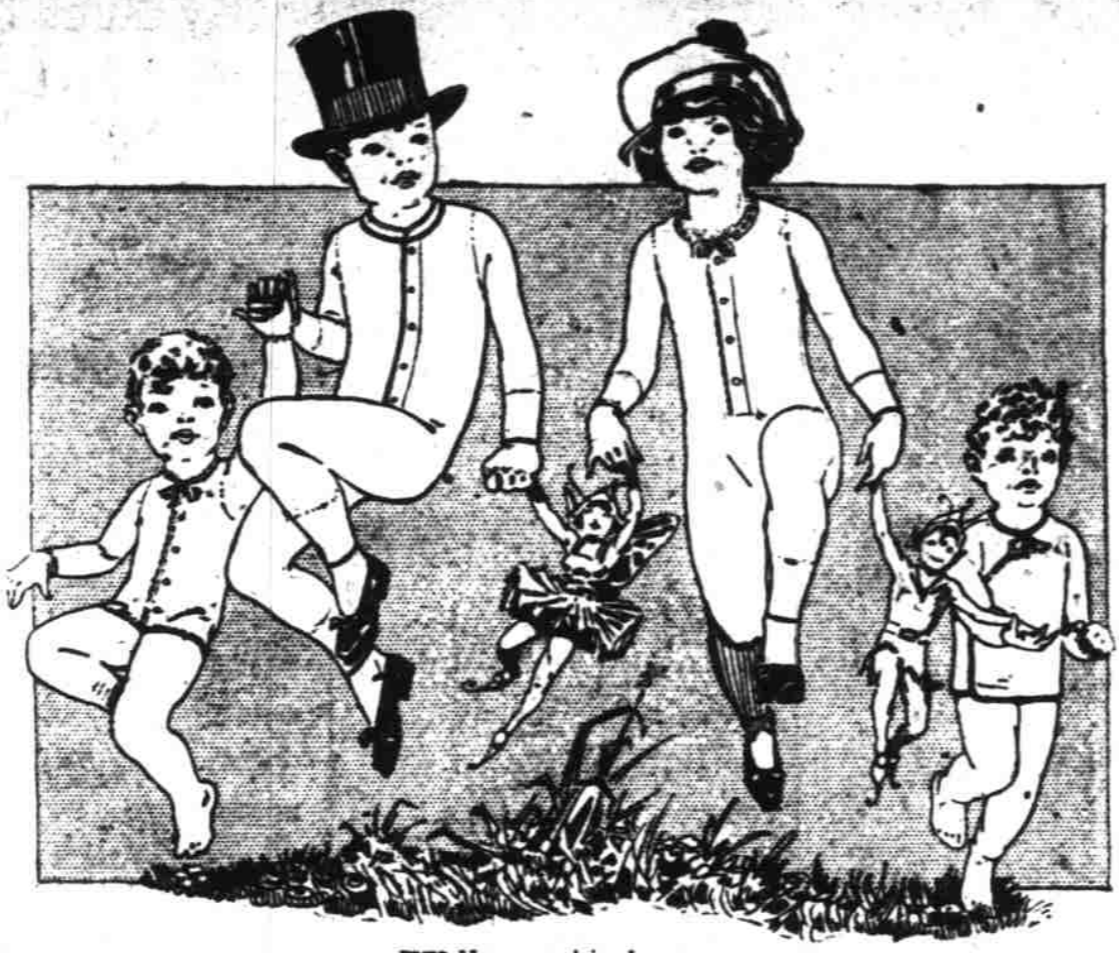
FITS-U came to join the game, LOTTA COMFORT too was there—Freedom is the middle name of Lackawanna Underwear.