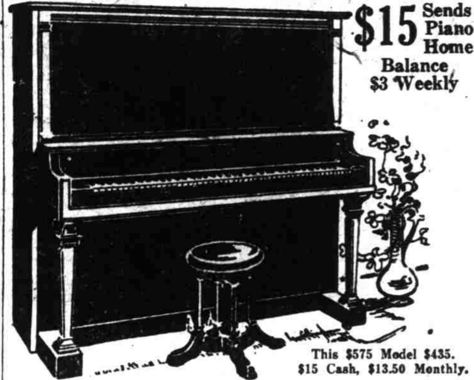
TAKE TWO AND ONE-HALF YEARS TO PAY FOR IT

We are upsetting all local tradition and precedent of the present piano market, trade difficulties, making it possible at this time for nearly everybody to buy a new piano or player piano.