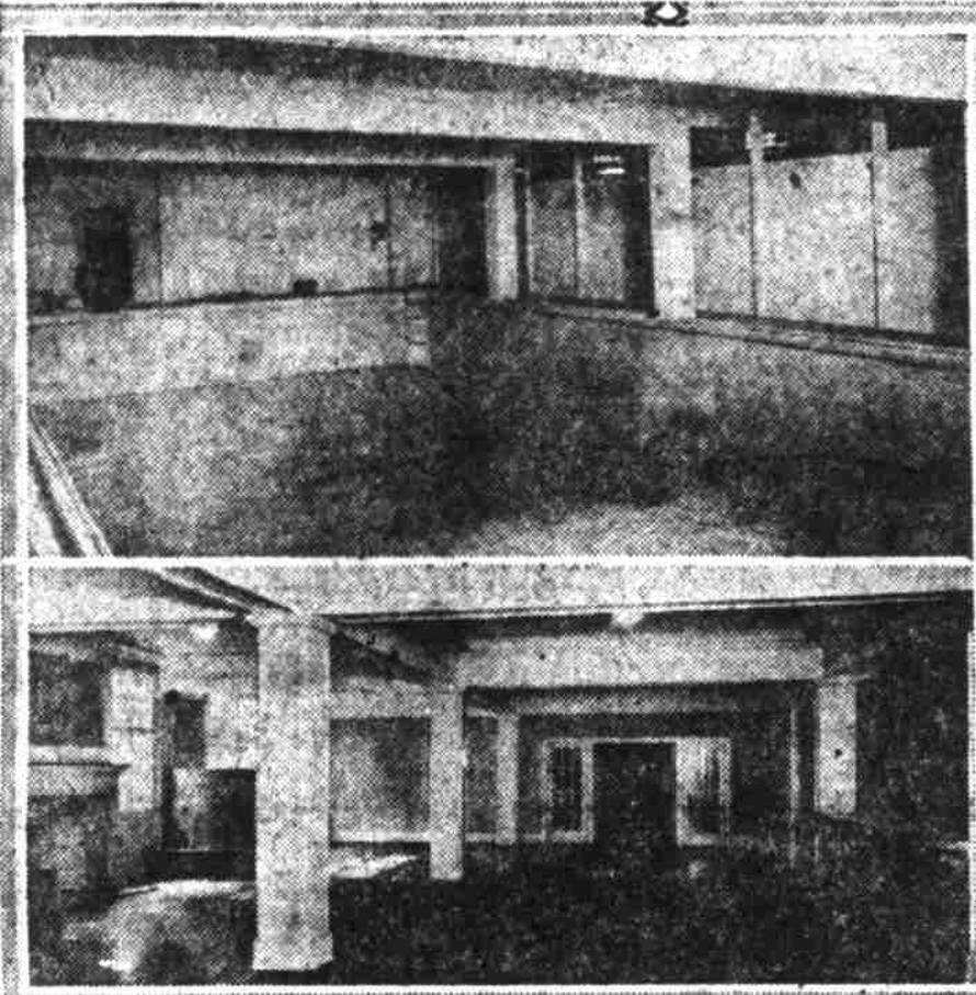
Exterior and interior views, showing lounge room and swimming pool, of new Knights of Columbus home at the southwest corner of Taylor and Park streets.