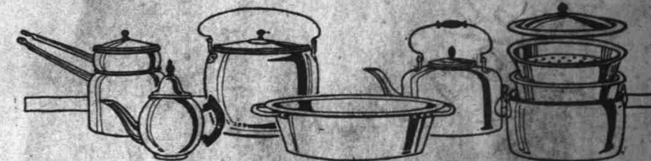
—SKETCHED FROM ALUMINUM WARE ON SALE.

A Birthday Sale Price That Hits Bottom, at Least for the Last Two Years