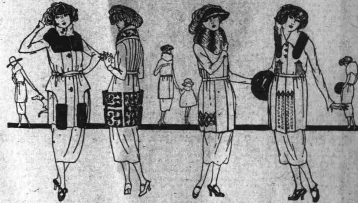
—SKETCHED FROM SUITS ON SALE.