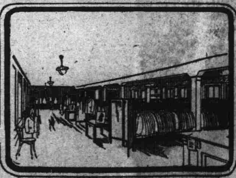
WEST END SALES FLOOR