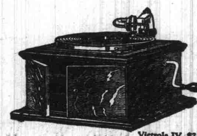
Victrola IV, $25 Oak