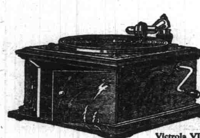
Victrola VI, $35 Mahogany or oak