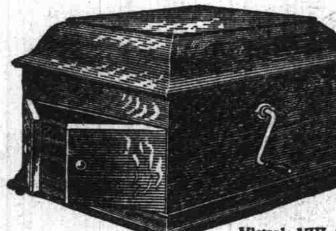
Victrola VIII, $50 Oak