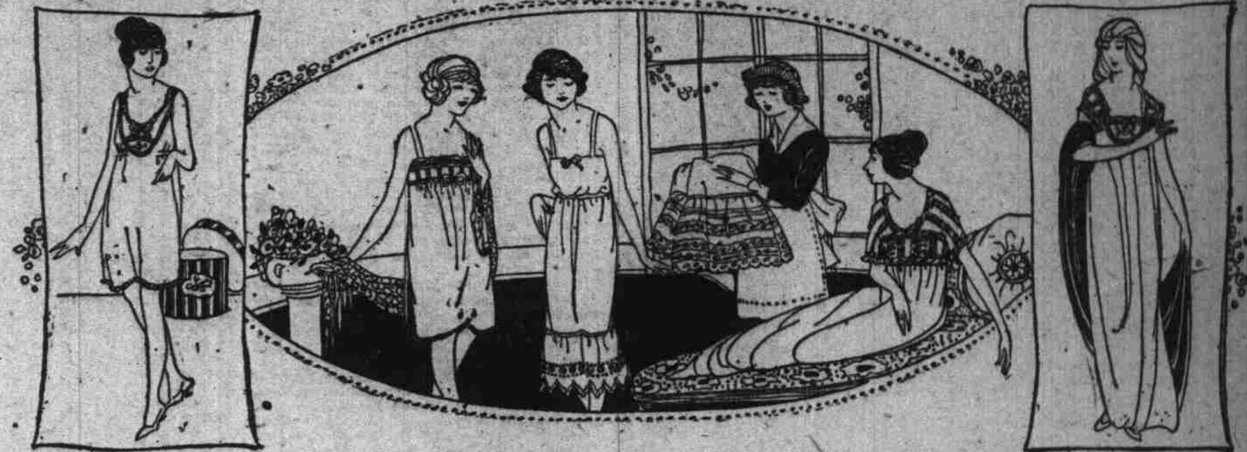
SKETCHED FROM GARMENTS ON SALE