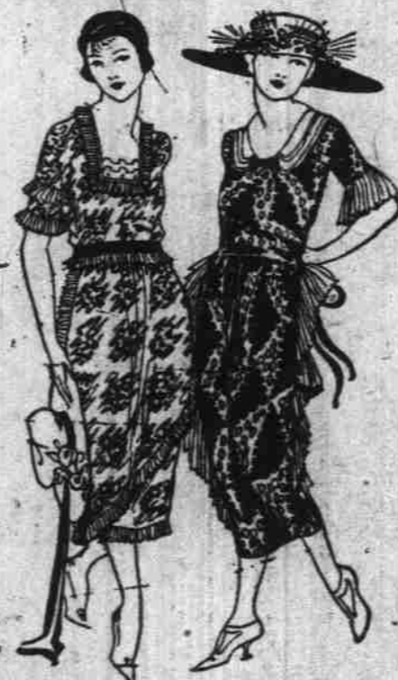
TWO STYLES SKETCHED

A Special Purchase —Exact Duplicates of Much Higher Priced Dresses. Perfect Fitting.