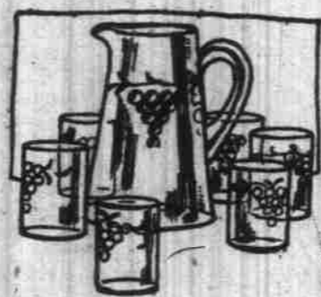
TABLE TUMBLERS AT LESS THAN TODAY'S WHOLESALE